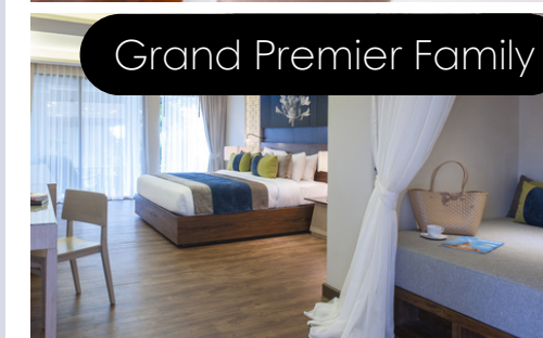
Grand Premier Family