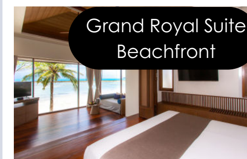
Grand Royal Suite Beachfront