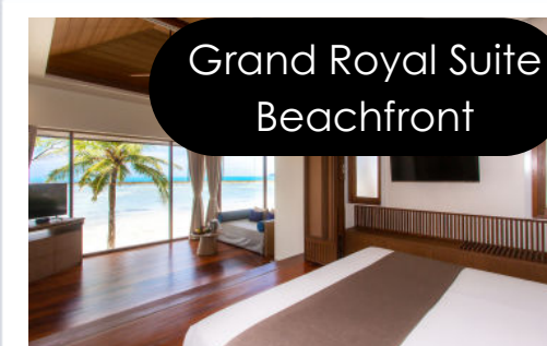
Grand Royal Suite Beachfront