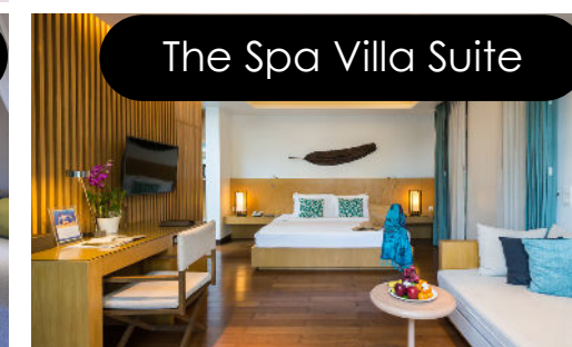
The Spa Villa Suite