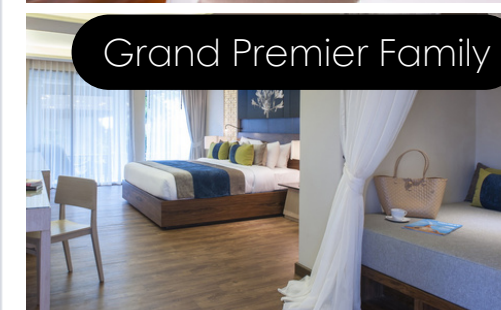
Grand Premier Family