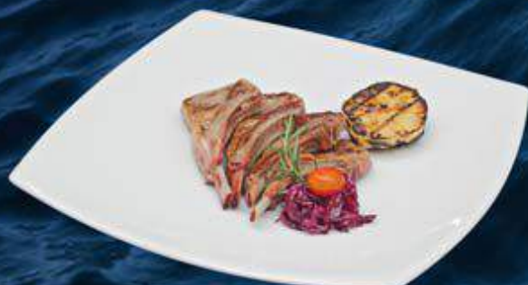
84. New Zealand Lamb Rack 180 g.