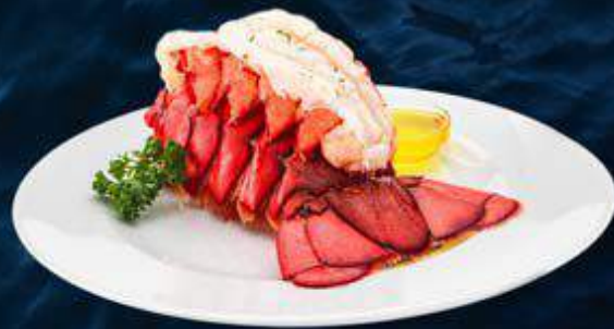
86. Maine Lobster