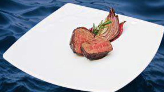
82. Australian Beef Tender Loin 180 g.