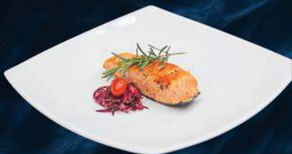
85. Norwegian Salmon Fillet 200 g.