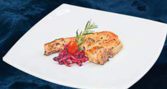
83. Kurobuta Pork Chop 180 g.