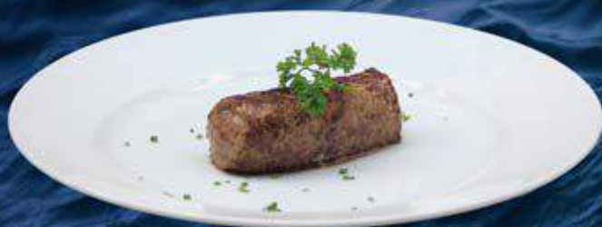
81. Australian Beef Loin 180 g.

All Served With Grilled Vegetables, Mixed Salad And A Choice Of a) Potato Wedges or b) French Fries 配烤蔬菜，混合沙拉和a) 烤土豆楔子或b) 炸薯条。